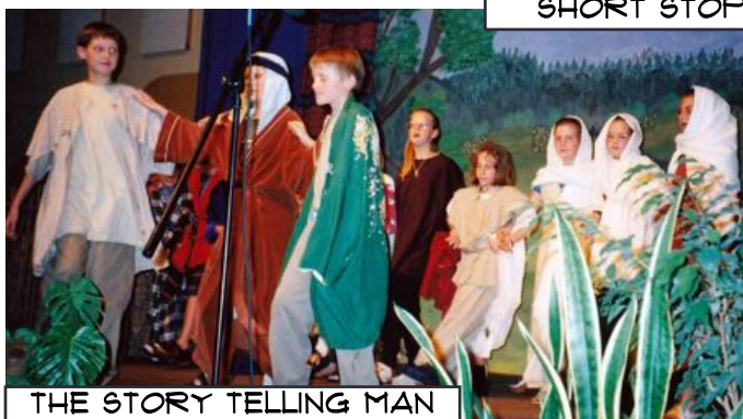
THE STORY TELLING MAN