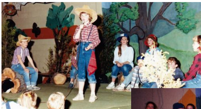
DOWN BY THE CREEKBANK