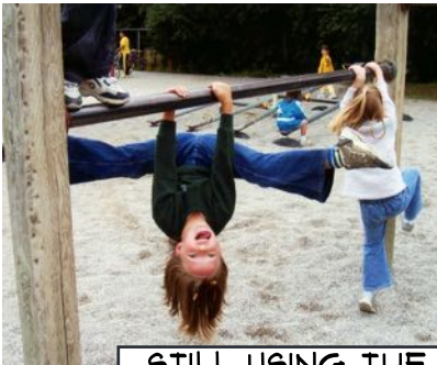
STILL USING THE SEESAWS AND BARS!