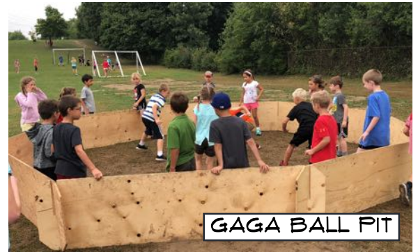
GAGA BALL PIT