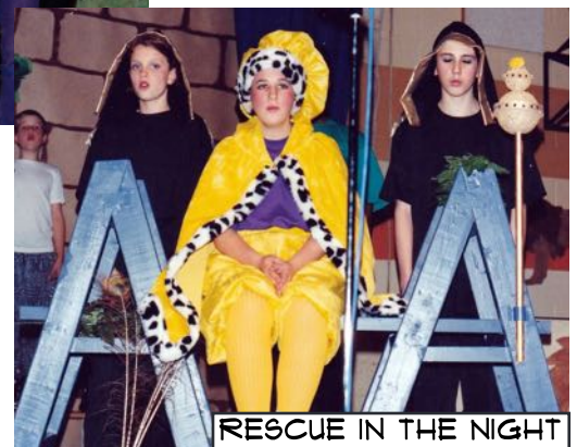
RESCUE IN THE NIGHT