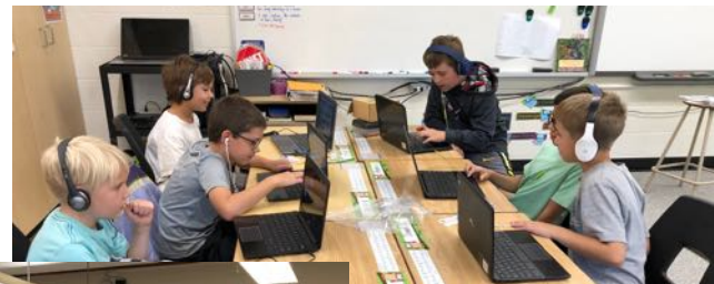
MOBILE CHROMEBOOK LABS