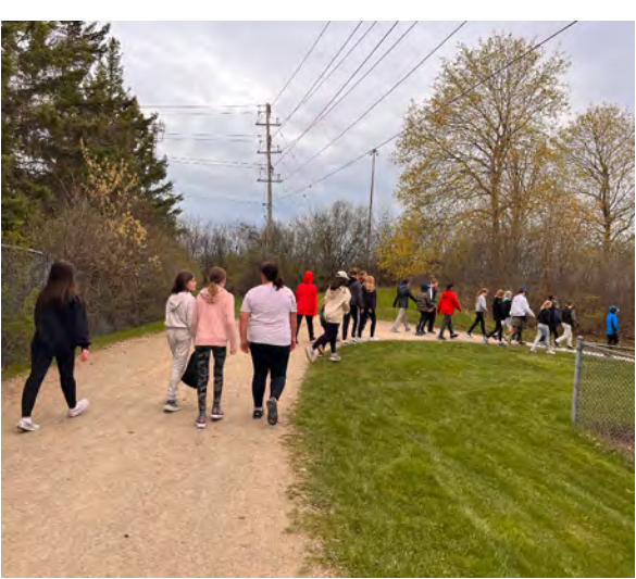
Thank you to everyone who volunteered on the day!