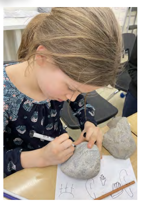
We had an Easter experience in our grade 3 classroom complete with Bible passages, music, and drawing to create the Easter stones.