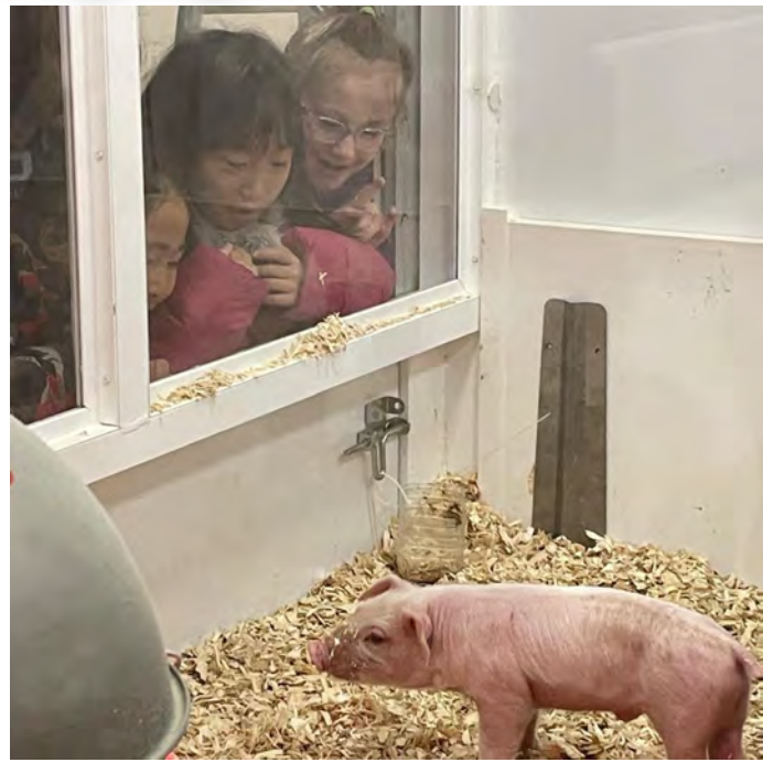
Grade 3 and 3/2 had a wonderful time at a Pizza Perfect experience. We explored Dairy, Soils and Vegetables, Meats, and Field Crops. So many volunteers from the Grand River Agriculture Society worked to put on a special day learning for us.