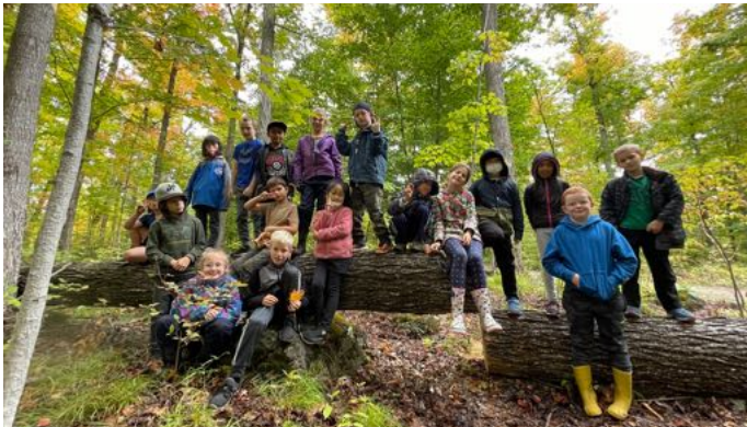
GCCS students learning about soil and plants at Mountsberg Conservation Area.