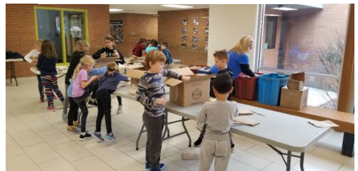
GCCS students are packaging and donating soap bars to Hope House for its market program.

Besides packaging soap, the Grade 3/2 students have been putting together a book which focuses on the A to Z's of what the students have learned about vulnerable people within the community.