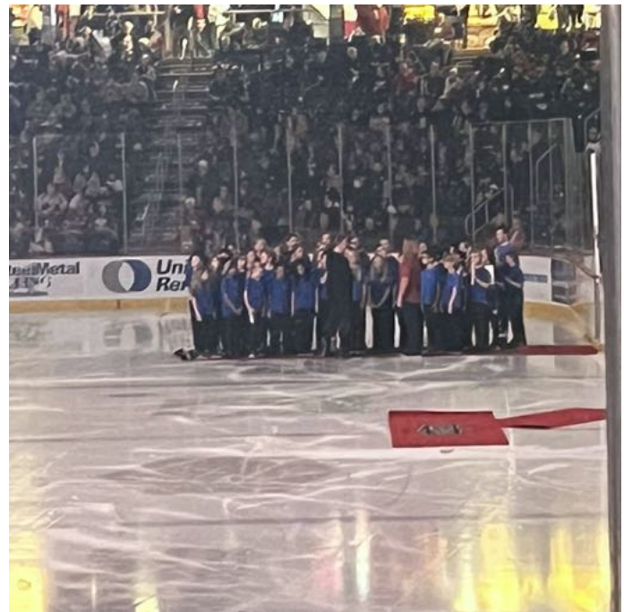
Singing "O Canada" at the Guelph Storm hockey game