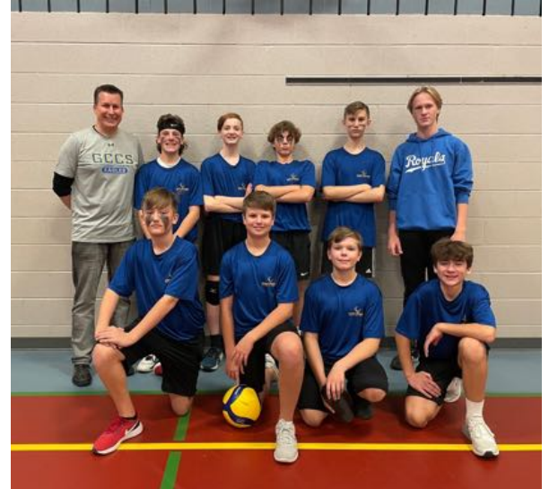
Volleyball team members

The girls' soccer team defended their title and won every game to be champions again! Congratulations!