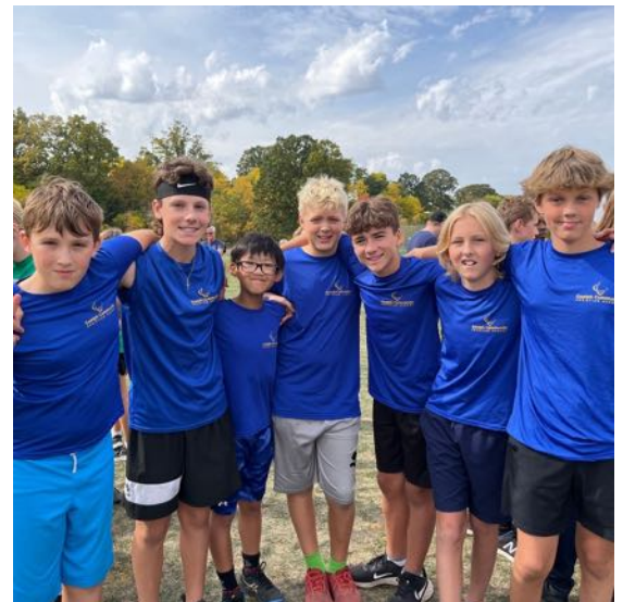
Cross country team members

Our cross country runners ran with great perseverance and represented our school well. We were thankful to see so much positive encouragement, leadership, and joy filled attitudes in all of our runners.