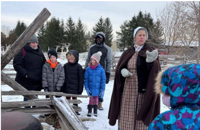
GCCS students at Country Heritage Park to learn about Canada's early settlers.