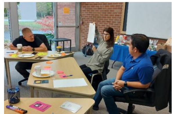
Board Retreat October 2022