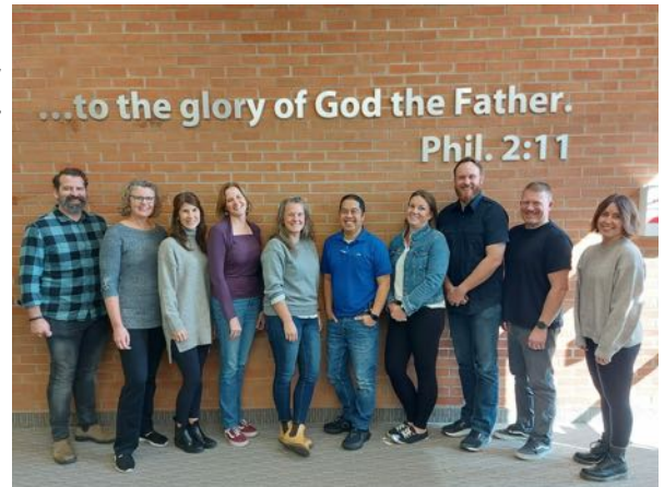
GCCS Board of Directors 2022 - 2023

Over the past few months, the Project Legacy Committee has been busy meeting with past and current GCCS families, community members, and prospective donors with the aim to raise money to realize the $500,000 matching offer which was very generously made by anonymous donors this past spring. That goal has now been reached and we can officially plan to move forward with the Legacy Classroom project this coming spring. The Legacy classroom will be a unique outdoor learning space which will have amphitheater seating. While we are excited about these developments there is much work still to do as the campaign will continue through the winter with the overall goal remaining to raise over $1.5 million. More information about campaign, which will include an invitation for you to participate and potentially give, will also be included in the next newsletter.