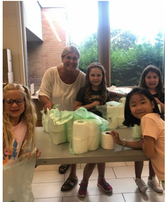
GCCS students working on a service project for Hope House.