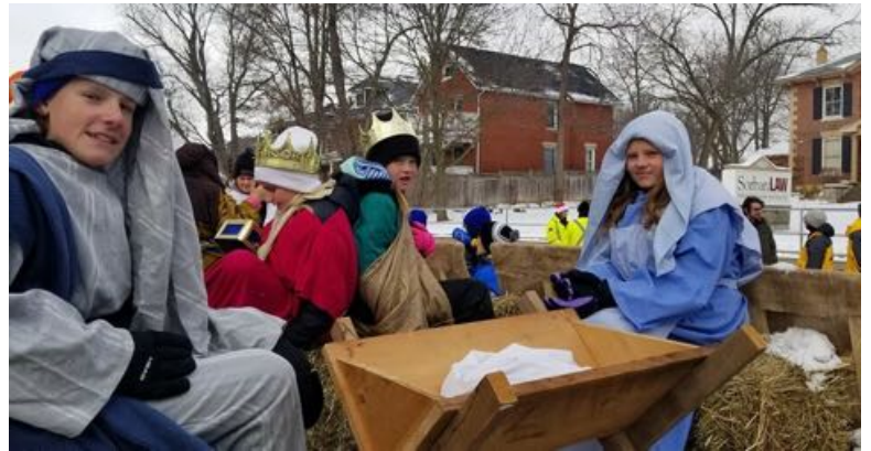
Guelph Santa Claus Parade