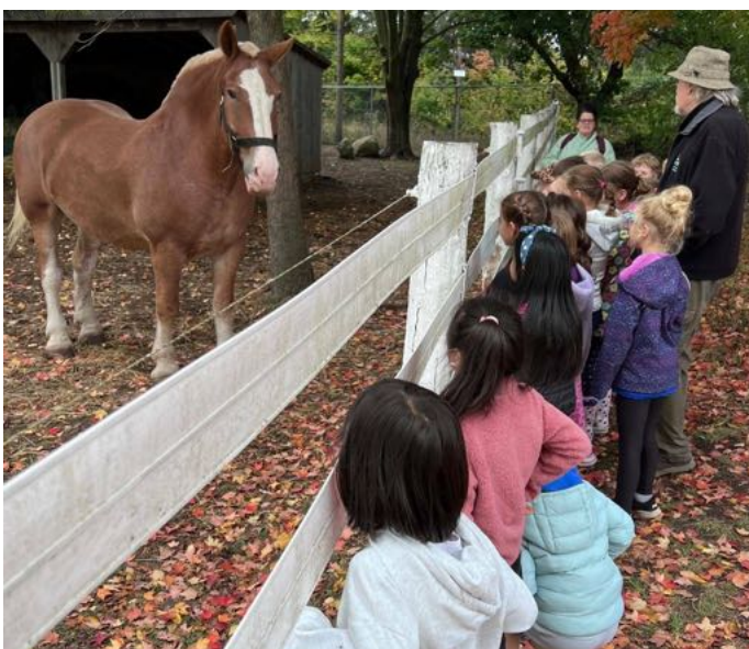
GCCS students at Mountsberg Conservation Area.